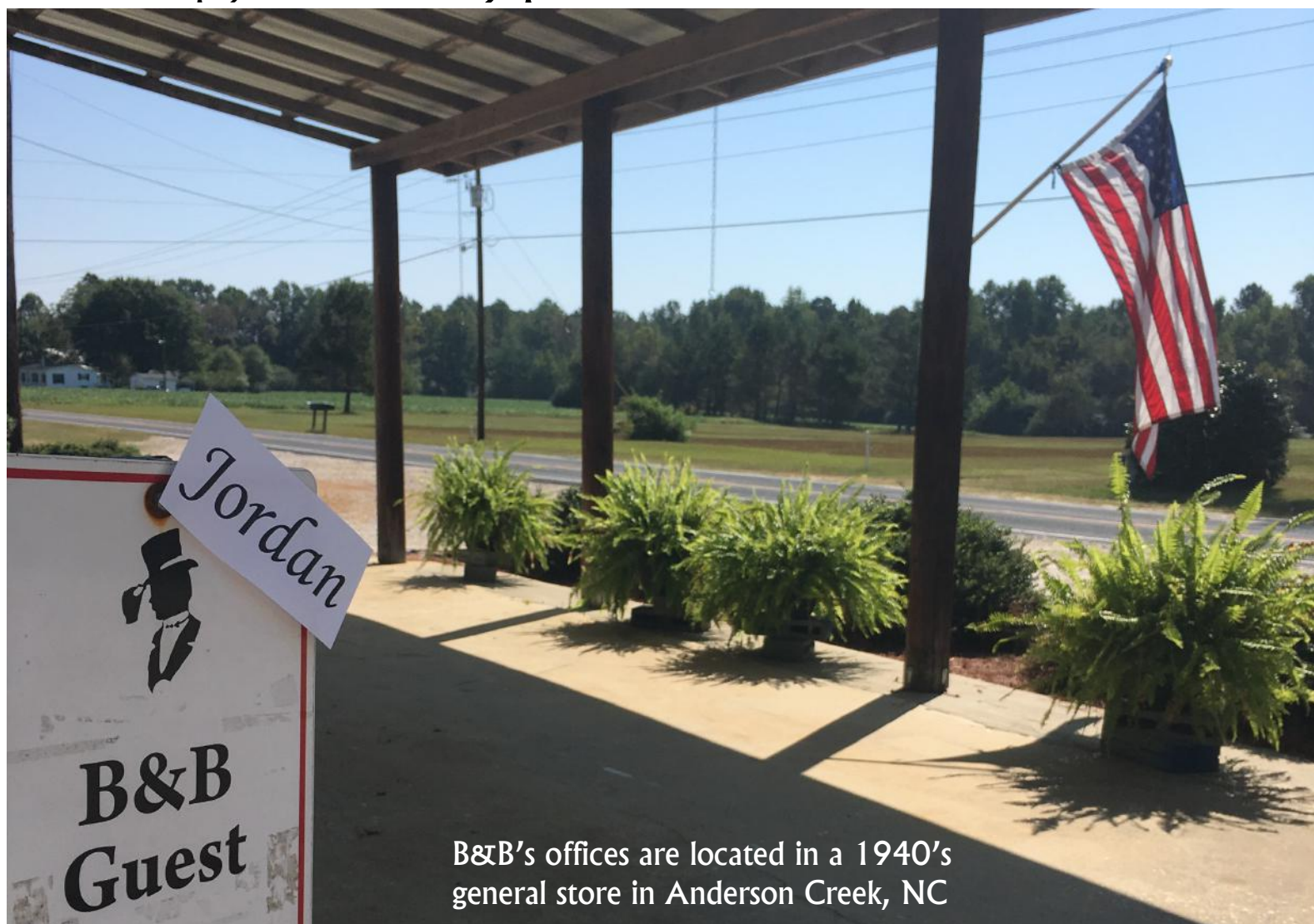
B&B's offices are located in a 1940's general store in Anderson Creek, NC