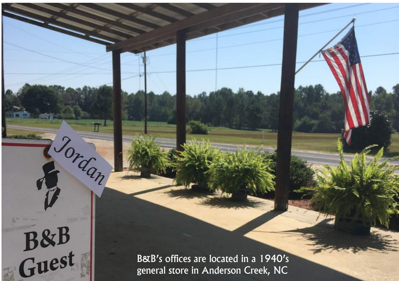
B&B's offices are located in a 1940's general store in Anderson Creek, NC