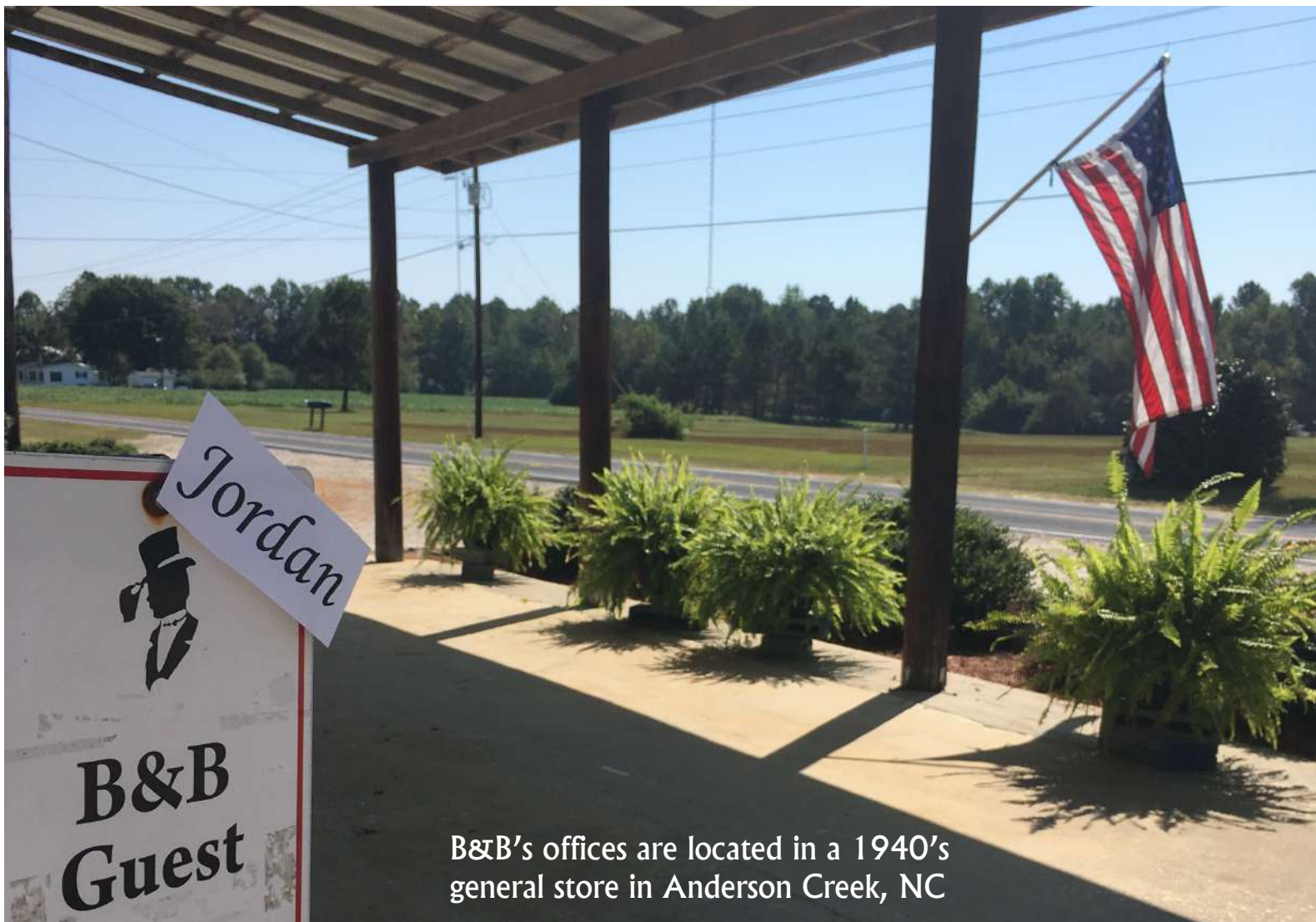
B&B's offices are located in a 1940's general store in Anderson Creek, NC